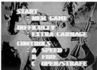
Fig.2 Menu Screen